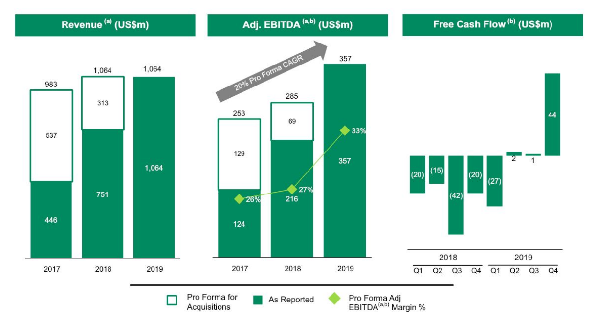
(a) Adjusted EBITDA, Adjusted EBITDA Margin, and Free Cash Flow are non-GAAP financial measures. For a discussion of our use of non-GAAP financial measures, including a reconciliation of (i) Adjusted EBITDA to net income (loss) and (ii) free cash flow to net cash provided by operating activities, please see the "Reconciliation of non-GAAP Financial Measures" section beginning on page 32 in Item 6 to our Annual Report on Form 10-K for the fiscal year ended December 31, 2019.

(b) Based on WillScot financials excluding the Corporate & other segment, which represented former Algeco and corporate costs (in 2017 only). Pro forma results include the results of WillScot, Acton, and ModSpace for all periods presented. The Acton and ModSpace acquisitions closed December 20, 2017 and August 15, 2018, respectively. Does not include Onsite Space LLC (d/b/a Tyson Onsite ("Tyson").